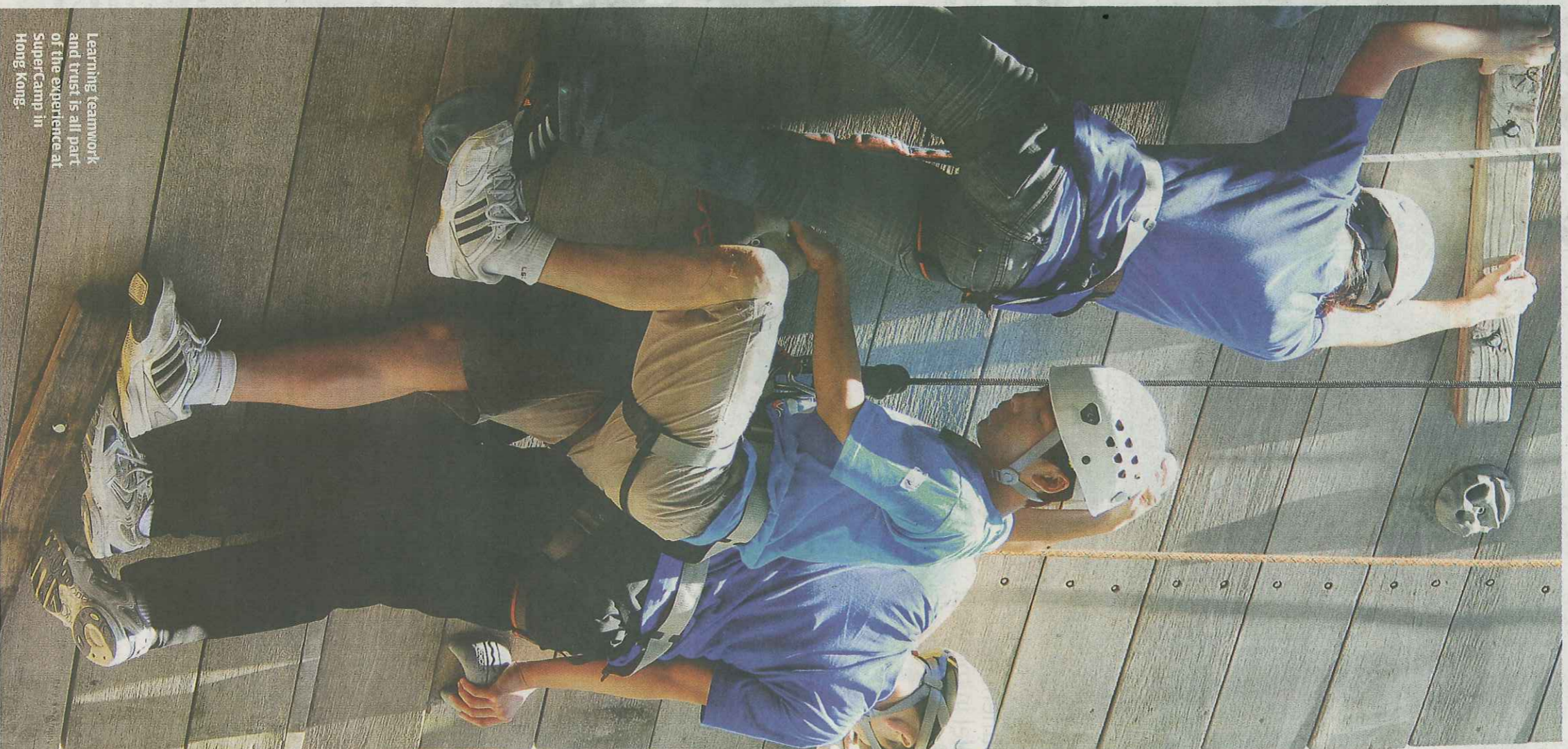
Learning teamwork and trust is all part of the experience at SuperCamp in Hong Kong.